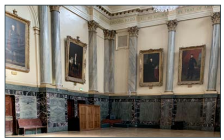
MAIN HALL, CUTLERS HALL

The day will precede the ASM at the University of Sheffield just as traditional "Masterclasses" at past ASMs.