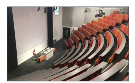
MAIN LECTURE HALL AT DIAMOND CENTRE

The emphasis will be on pictorial, graphical and /or video step wise exposition of surgical technique. This should serve as a refresher following the hiatus in normal surgical practice in the last year.