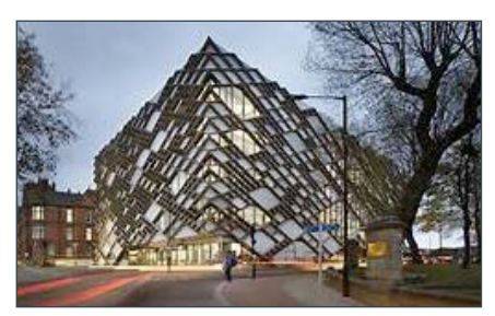
DIAMOND CENTRE, MAIN VENUE

Saturday 9 and Sunday 10 October: Diamond Centre, Sheffield University City Centre